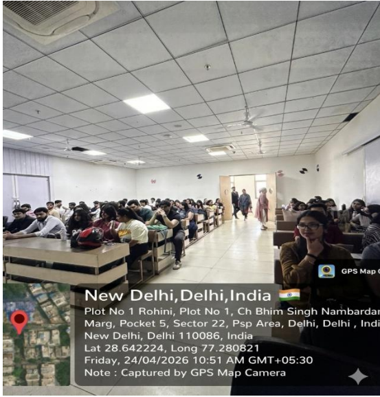
New Delhi, Delhi, India 🇮🇳 Plot No 1 Rohini, Plot No 1, Ch Bhim Singh Nambardar Marg, Pocket 5, Sector 22, Psp Area, Delhi, Delhi , India New Delhi, Delhi 110086, India Lat 28.642224, Long 77.280821 Friday, 24/04/2026 10:51 AM GMT+05:30 Note : Captured by GPS Map Camera