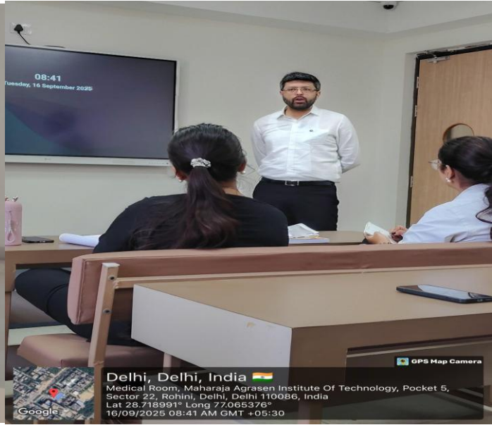
Delhi, Delhi, India 🇮🇳 Medical Room, Maharaja Agrasen Institute Of Technology, Pocket 5, Sector 22, Rohini, Delhi, Delhi 110086, India Lat 28.718991° Long 77.065376° 16/09/2025 08:41 AM GMT +05:30