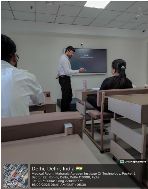
Delhi, Delhi, India 🇮🇳 Medical Room, Maharaja Agrasen Institute Of Technology, Pocket 5, Sector 22, Rohini, Delhi, Delhi 110086, India Lat 28.719004° Long 77.065377° 16/09/2025 08:41 AM GMT +05:30