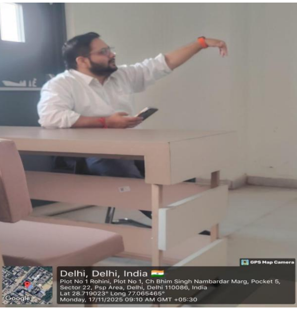
Delhi, Delhi, India 🇮🇳 Plot No 1 Rohini, Plot No 1, Ch Bhim Singh Nambardar Marg, Pocket 5, Sector 22, Psp Area, Delhi, Delhi 110086, India Lat 28.719023° Long 77.065465° Monday, 17/11/2025 09:10 AM GMT +05:30