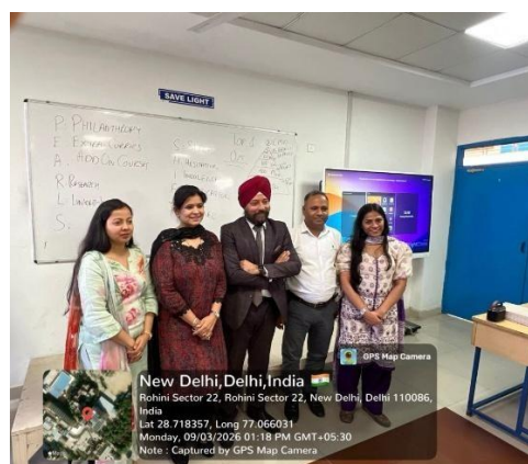
Felicitation of Resource Persons by Associate Professor, Department of Commerce