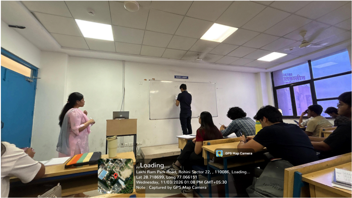
Student trying to present their understanding of the concept