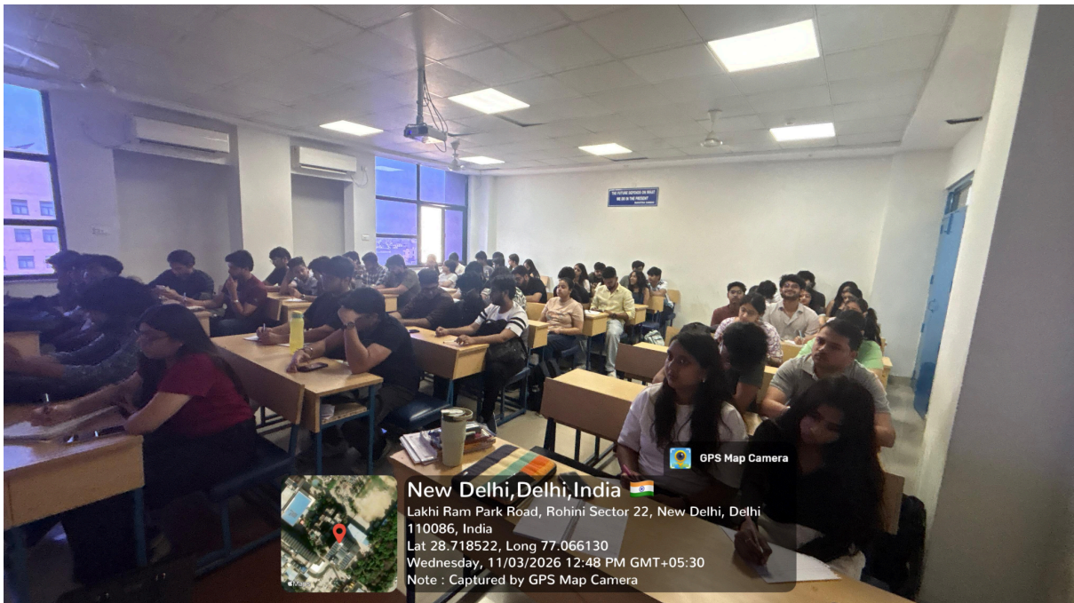
Students solving the case study questions