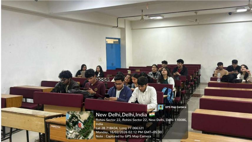
STUDENTS DOING AND CREATING GOOGLE FORMS