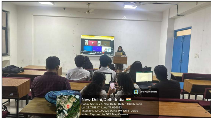
THE RESOURCE PERSON DELIVERING THE LECTURE ON GOOGLE TOOLS