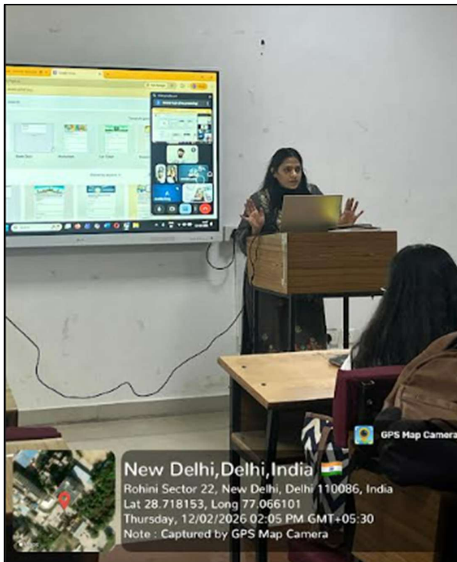
RESOURCE PERSON PROVIDING HANDS-ON TRAINING ON GOOGLE FORMS