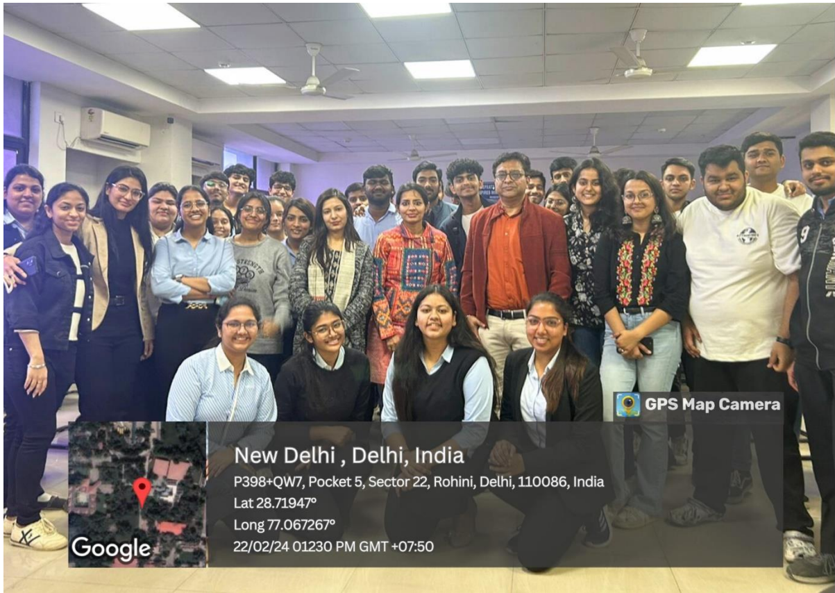
A successful and fruitful session.