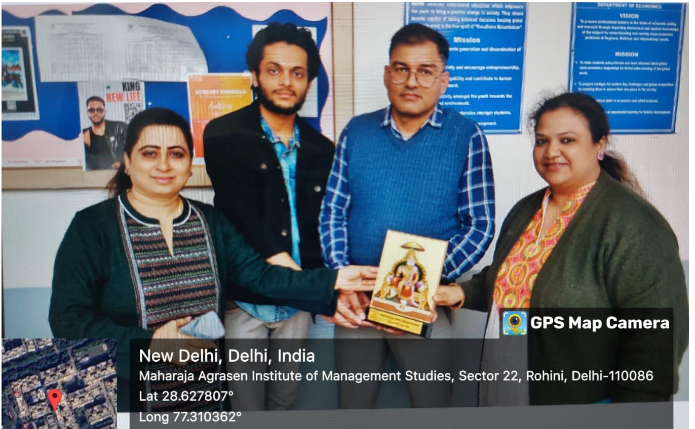
New Delhi, Delhi, India Maharaja Agrasen Institute of Management Studies, Sector 22, Rohini, Delhi-110086 Lat 28.627807° Long 77.310362°