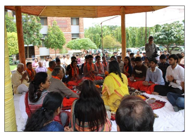
Students of BCA attending HAWAN Ceremony at MAIMS

The event set a positive and inspirational tone for the academic year, as both students and faculty look forward to achieving great heights together. The management and faculty of MAIMS are committed to providing quality education and fostering a nurturing environment for all students.