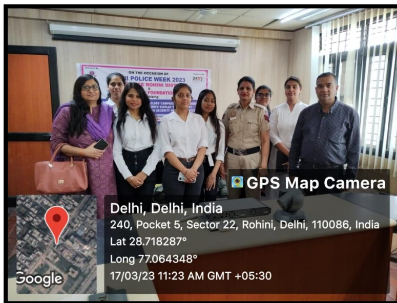
Glimpse of Visit