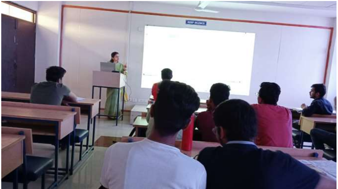
DAY 4: 30/03/2023