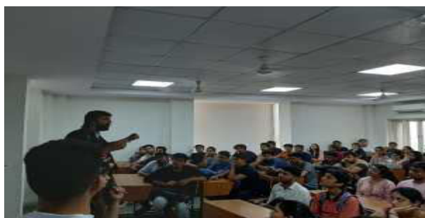
Students interacting during Pre-placement talk conducted by Vikas Multicorp Ltd. On January 24, 2019

The Talk was also a chance to clarify several aspects of one's relationship with the organization, such as the income breakdown, job profile, place of employment, bond details, and so on. Total 143 students in all took part in the discussion.