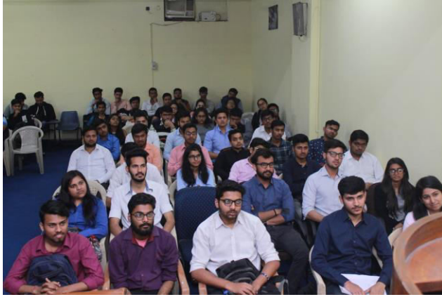
Students attending Training program for higher education conducted during 13th March 2019 - 29th March, 2019

61 students participated in the training appreciation for the training was unanimous. As the weeks progressed, there was a noticeable improvement in the students' problem-solving strategies. The training program was extremely informative and not only assisted the students in resolving any doubts they had regarding upcoming exams but also enabled them to enhance their overall exam preparedness for the future.