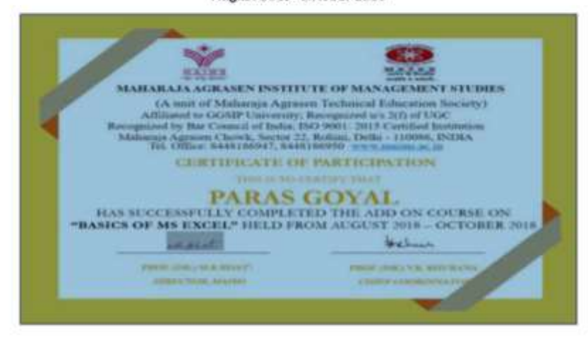
August 2018- October 2018