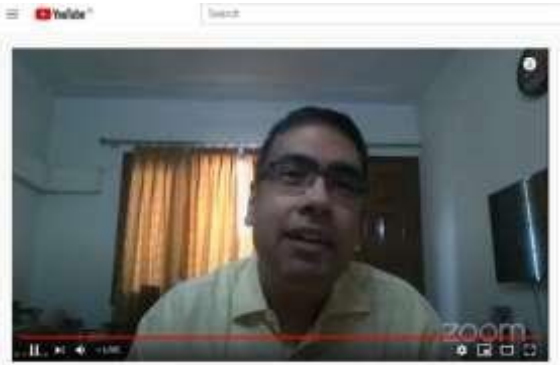
MAIMS Delhi IN Live Stream

16 watching now - Started streaming 83 minutes ago