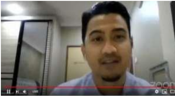
MAIMS Delhi IN Live Stream

Tel. Office: 8448186947, 8448186950 www.maims.ac.in