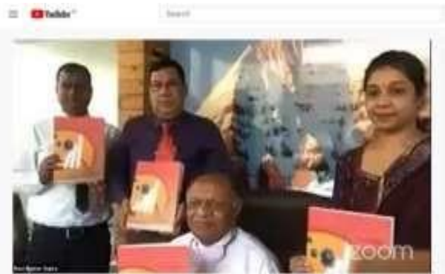
MAIMS Delhi IN Live Stream