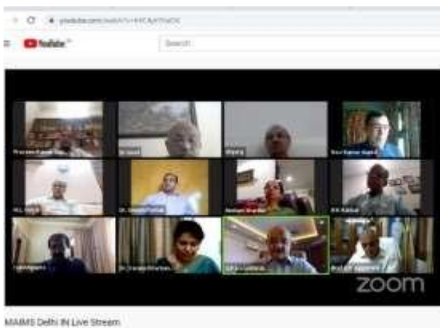
MAIMS Delhi IN Live Stream