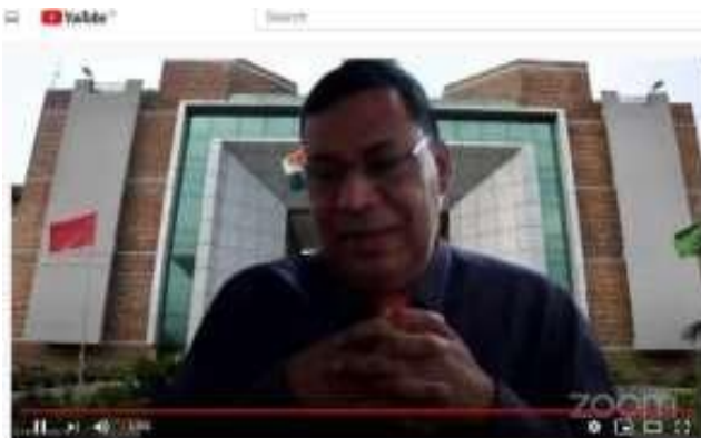
MAIMS Delhi IN Live Stream