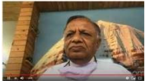
MAIMS Delhi IN Live Stream

35 watching now - Started streaming 6 minutes ago