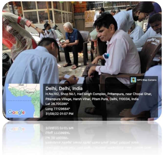
Figure 2, 3, 4 and 5: Student Volunteers Collecting data at the Pitampura Village