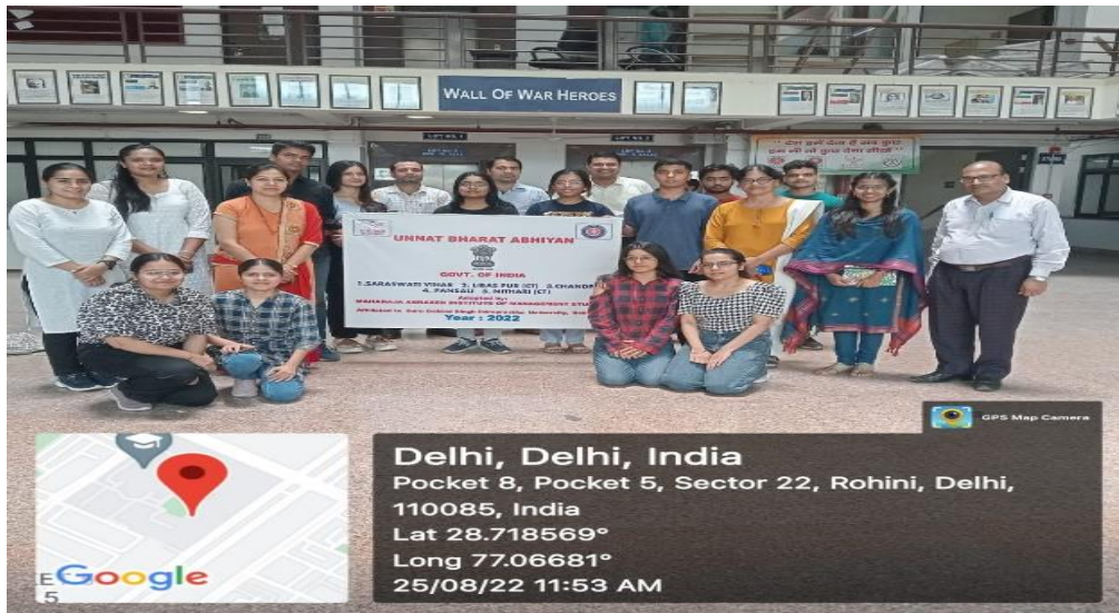
Figure 1: Volunteer Training for Unnat Bharat Abhiyam on 25.08.2022

coordination with local administration and other stakeholders. Some moments were captured in both the visits and the same are as below: