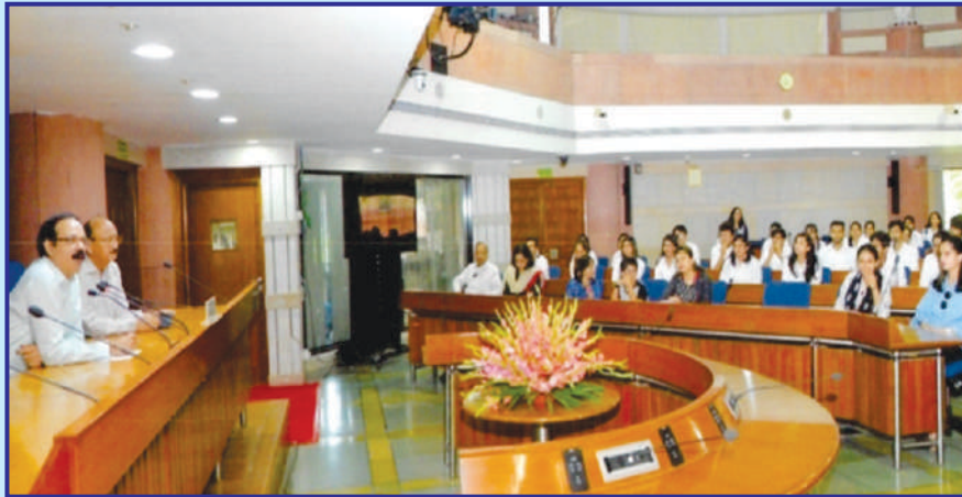
Additional Director, BPST addressing the students of MASOL