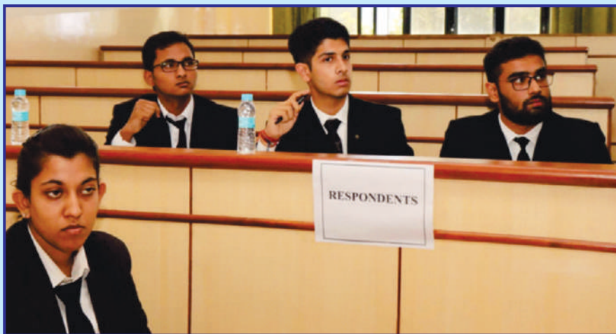
Students of MASOL at the National Moot Court Competition held at IMS Unison University, Dehradun.

Having started their studies in the Law school in August, they were novices to the concept of moot court and were hence appreciated for their effort and awarded certificates of participation for the same.