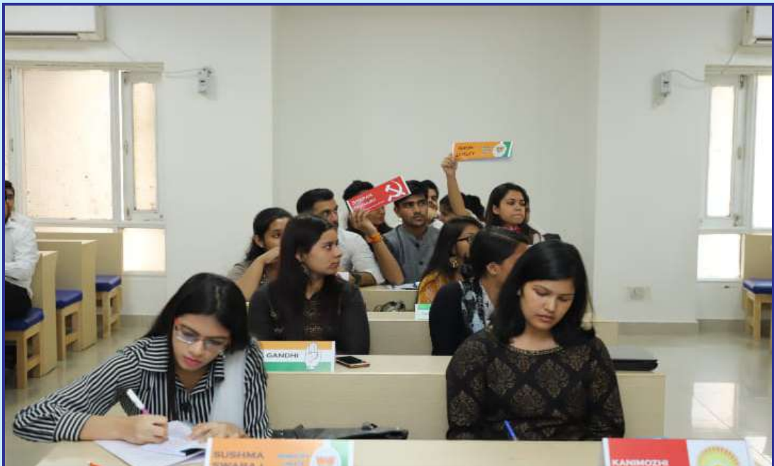
Students of MASOL (team AIPPM) participating in the Model United Nations