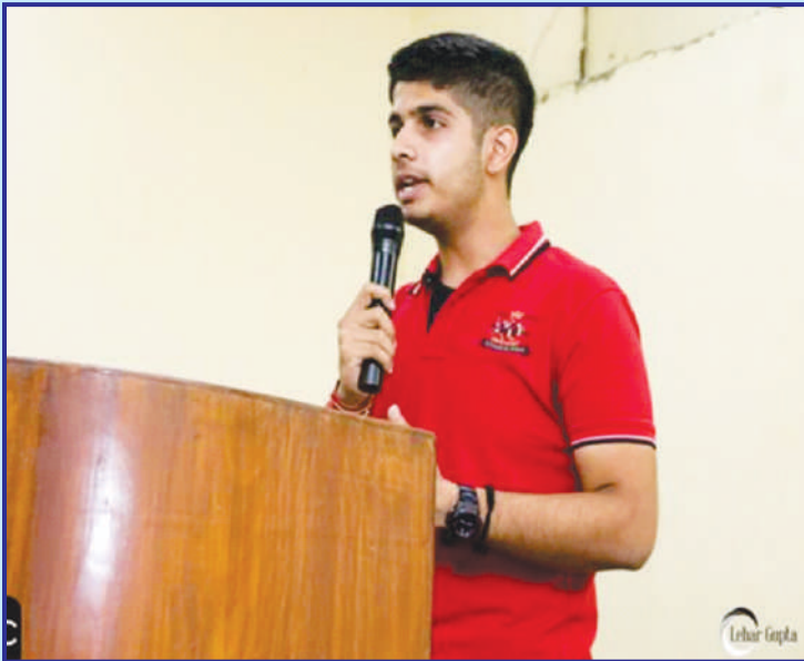
Student of first year MASOL participating in an Inter-collegiate Debate competition