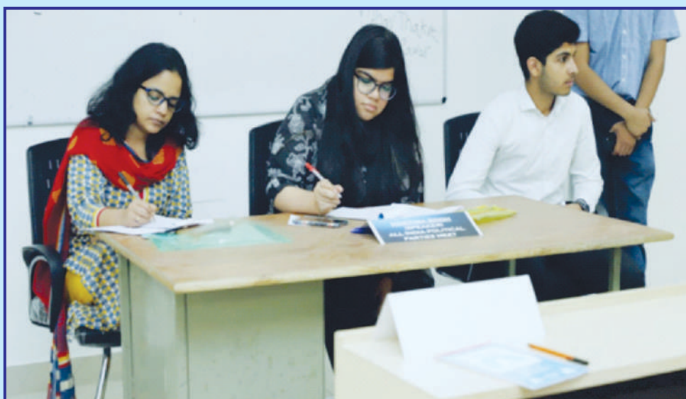
The Executive board, Model United Nations along with a faculty member