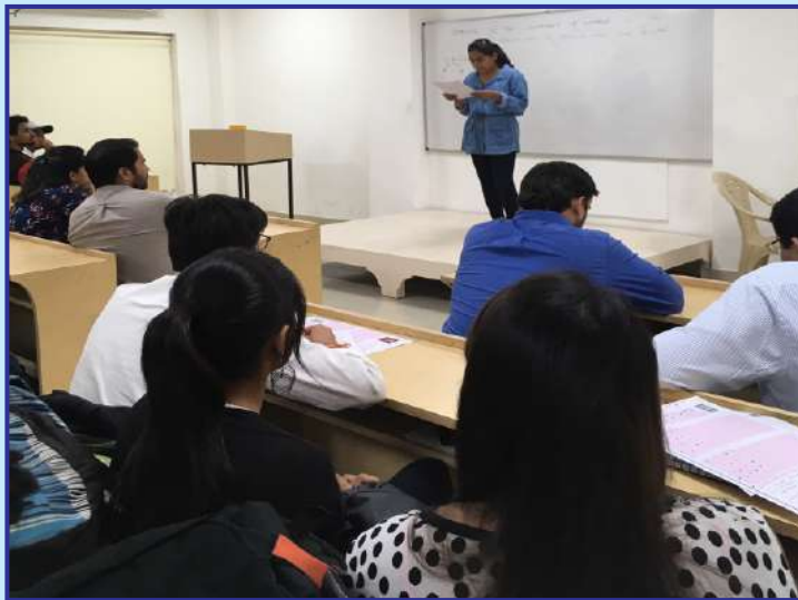
Student of MASOL participating in the Seminar