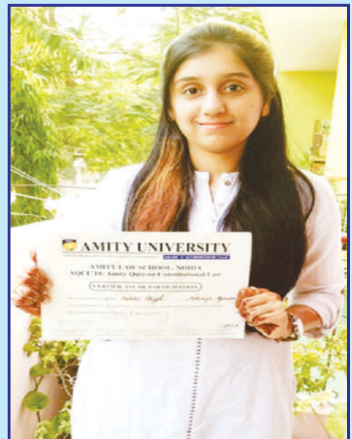
Student of MASOL with her certificate of participation in legal quiz on Constitutional Law →