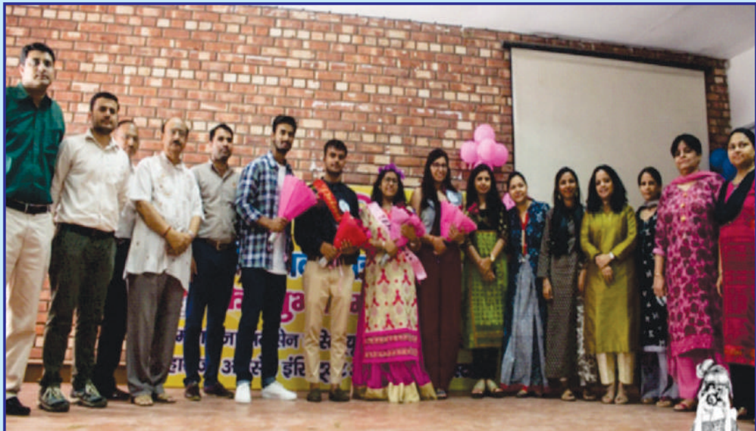
Faculty members along with the winners on the occasion of Fresher's Party