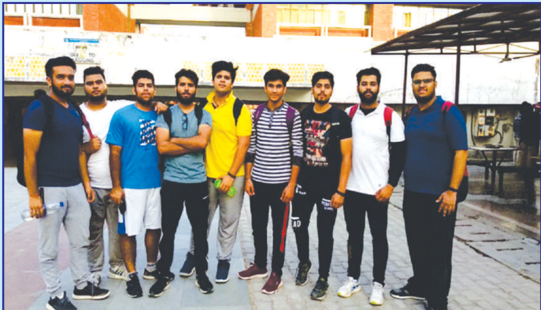
MASOL Sports team (boys)