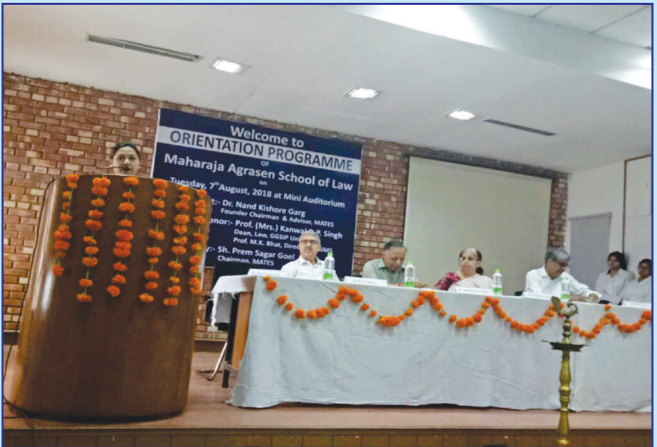
Welcoming the Dignitaries for the Orientation Programme