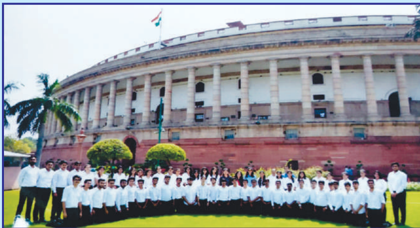
Students of 1 st Year - Section A, MASOL at the Parliament house