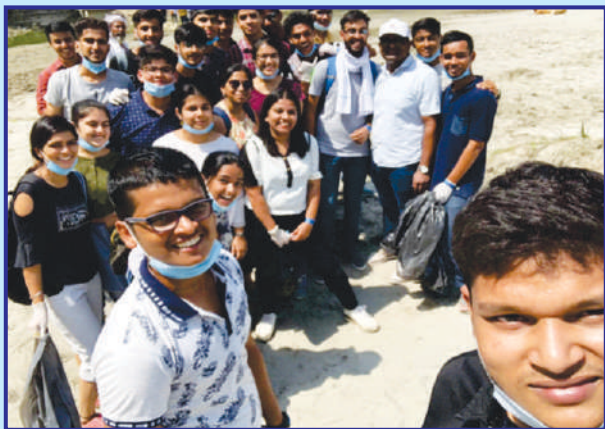
Students of MASOL participating in the cleanliness drive

The first-year students participated in the world's first 'cleanup day' held on September 15, 2018 at Kashmere Gate, Delhi. The cleanliness drive was a social action program aimed at combating the global solid waste problem.