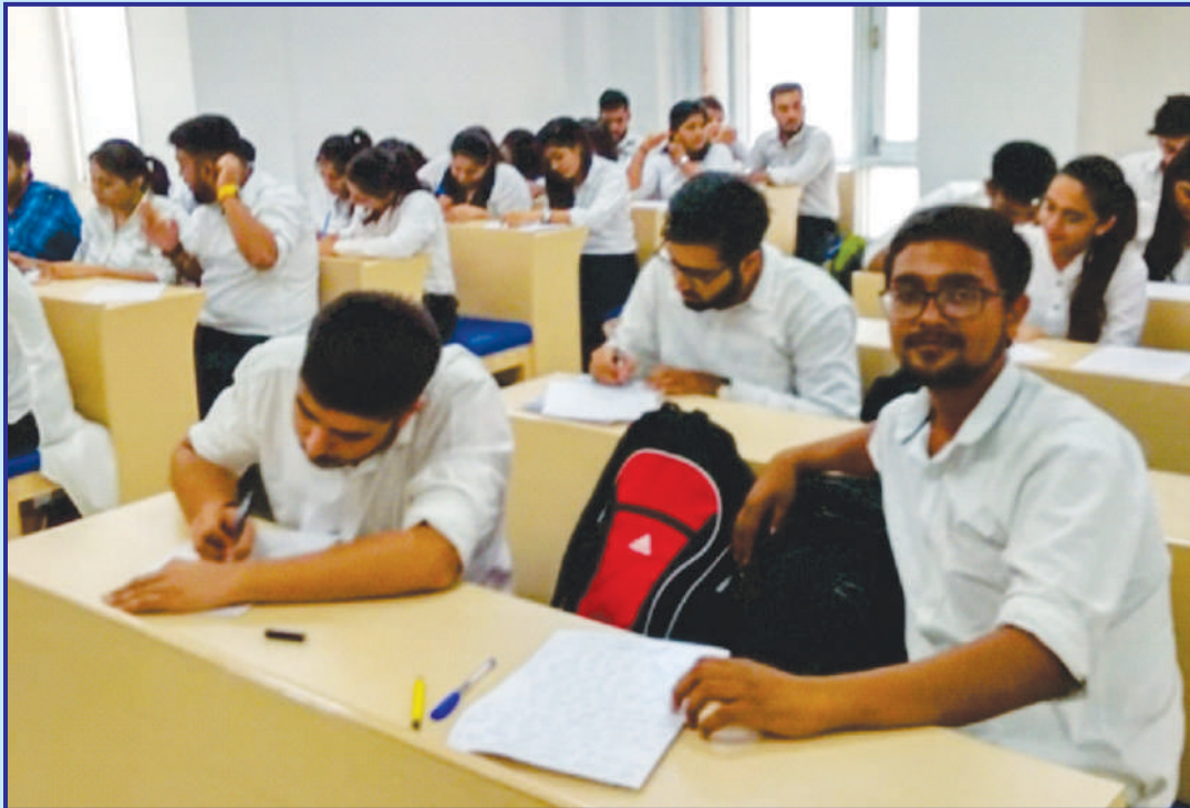
Students of MASOL participating in Essay Writing competition