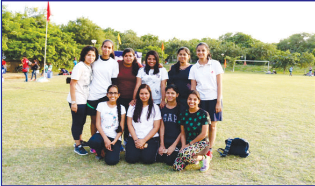
Students of MASOL participating in the 15 th Annual Inter- Collegiate Sports Meet