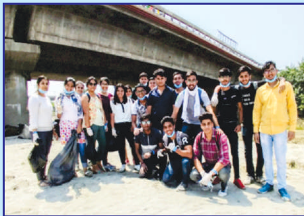
Students of MASOL collecting waste near Kashmere gate on the occasion of World Cleanliness Day