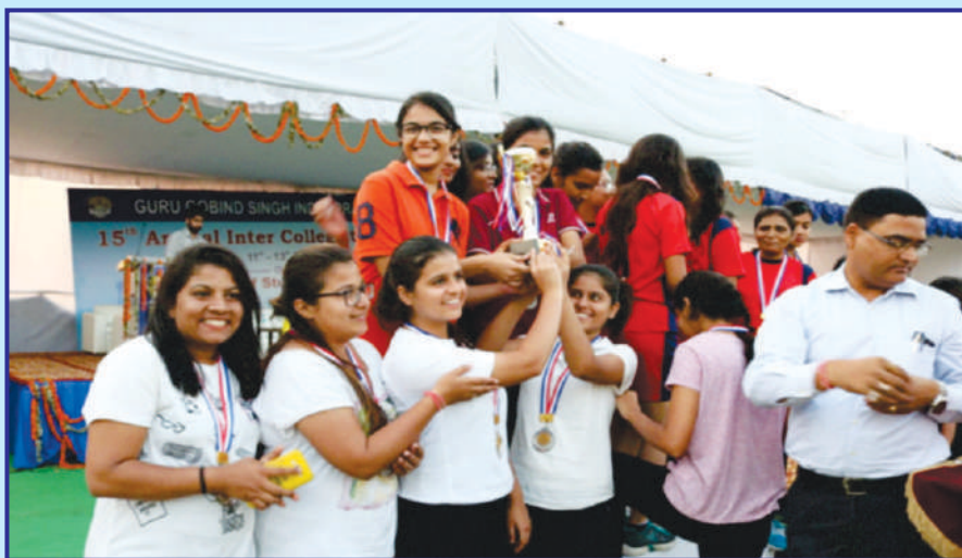
Winners of MASOL Volleyball team (girls)

The students of Maharaja Agrasen School of Law participated in the 15th Annual sports meet organized by the GGSIP University, Delhi (Main Campus) between October 11 - October 13, 2018. The girl's team of MASOL bagged the second position in the Volleyball event.