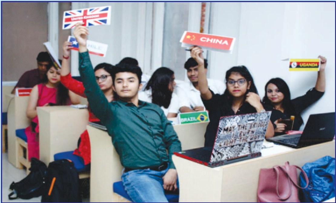
Students of MASOL (team UNHRC) participating in the Model United Nations