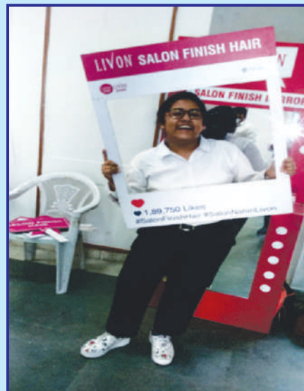
Students of MASOL participating in the Fresh Face contest organized by the Times of India